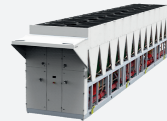
12 x OptiChill Free Cool™ air-cooled chillers with Enhanced Free Cooling™