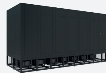
64 x SmartCool ONE™ chilled water CRAHs