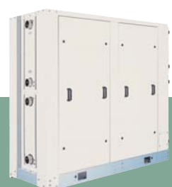
Ultima Water Cooled Chiller