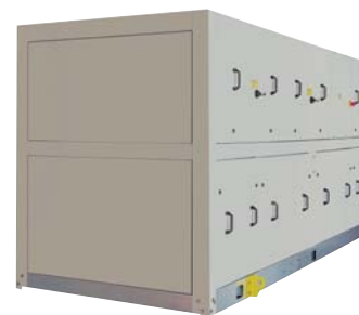
UWC 1200D designed for HIC

Set as 'run and standby' and pre-supplied with non-ozone depleting R407C refrigerant, the two UWC chillers utilise far less refrigerant charge than the chillers they have replaced and are a lot more efficient. One unit is able to manage the whole system.